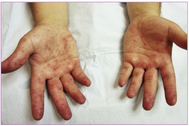
Figure 1: Illustrative example of the classic Hand Foot and Mouth Disease palmar rash seen in our patient. Ramirez-Fort, M. K., et al, Journal of Clinical Virology, 60(4), 381-386. Reproduced permission from Elsevier.