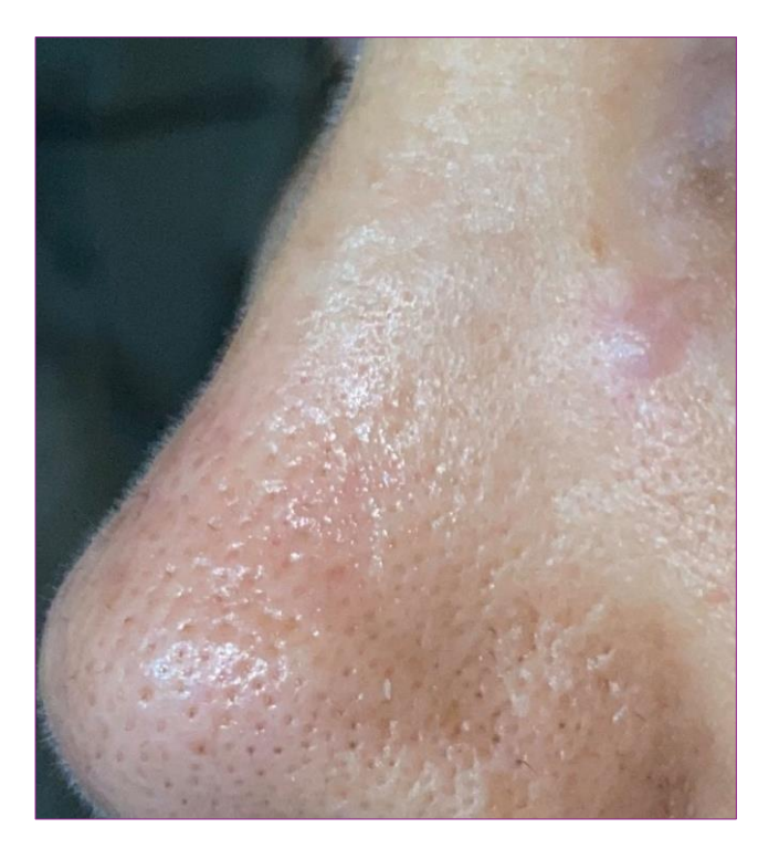
Figure 1 . Mucinous Carcinoma Presenting as a Well-Demarcated Nodule on the Left Nasal Bridge.

of epithelioid cells with abundant mucin around and inside the islands (Figure 2). The preliminary diagnosis was probable primary cutaneous mucinous carcinoma.