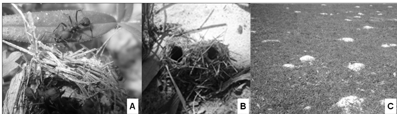
Fig. 1 – Acromyrmex balzani (Emeri) in the study area. A – Workers in the nest entrance. B – Detail of a nest entrance formed by two tubes of straw and other vegetable waste. C - General view of the area with nest mounds (blank spots).

The study was performed on a fragment of grassland, located in the municipality of São Cristóvão, Sergipe, Brazil (11 ° 00'54 "S, 37 ° 12'21" W). The dominant vegetation consists of grasses and herbs, mainly Paspalum notatum Flüggé (Poaceae), Cynodon dactylon L. (Poaceae) and Richardia brasiliensis Gomes (Rubiaceae) (Poderoso et al., 2009). The average annual temperature is 29 °C with average annual rainfall of about 2000 mm. The soil type is Spodosol, mainly sandy clay, deep, with low fertility, high porosity (draining rainfall), high acidity and salinity (Sousa-Souto et al., 2012b). The leaf-cutting ant A. balzani is commonly found and is clearly the most abundant leaf-cutting ant species in the study area. Nests of A. balzani are small (0.2 to 1m 2 of area) compared with other leaf-cutting ant species but with population densities that may reach beyond 100 nests per hectare (Poderoso et al., 2009; Sousa-Souto et al., 2012b; Silva Junior et al., 2013). Each nest has a single entrance (Fig. 1 A-B) with a depth varying from 12 to 150 cm. This ant species relies mainly on leaves from monocotyledons (Fowler et al., 1986) which are deposited within the nest chamber (Poderoso et al., 2009). The waste material is delivered outside the colony, forming small piles of refuse (Mendes et al., 1992; Sousa-Souto et al., 2012b).