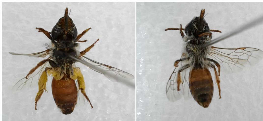
Fig 2. Hind legs of A. savignyi : (a) female with load of pollen grains, (b) male.

in Table 1. The results of GLMM showed that females had significantly higher visitation frequency and visitation rate while lower stay time than the males. The results of t-test showed that females harvested and deposited more pollen grains than the males, potentially due to the presence of scopa on the hind legs of females (Fig 2).