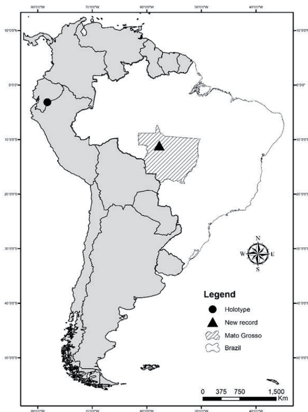
Fig 1. Distribution map of Gnamptogenys vriesi .

Little is known about the distribution of most ant species due to the scarcity of inventories performed in most biomes (Brandão et al., 2008). In the Amazon, most of these inventories have been concentrated in the eastern and central regions (Vasconcelos et al., 2006; 2010; Oliveira et al. 2009; Bastos & Harada, 2011; Baccaro et al., 2012). Therefore, efforts should be made in the southern Amazon rainforest, as well as in Mato Grosso state, Brazil where the ant fauna is practically unknown (Vicente et al., 2011; 2012), and historically the region has faced strong pressure from the agricultural frontier and intensive anthropogenic disturbances.