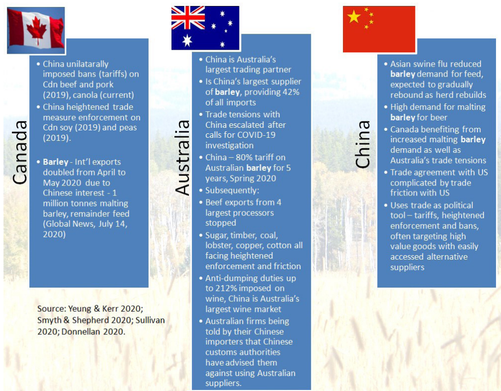
FIGURE 1. EXAMPLES OF TRADE TENSIONS RECENTLY EXPERIENCED BY EXPORTERS SUPPLYING CHINA

The efforts and actions of domestic lobby and special interest groups can also affect Canada's ability to produce, transport and export agri-food products. Recent rail blockades 8 created months-long bottlenecks in transport from producing areas to ports, which affected domestic and international shipments of food products. The Canadian