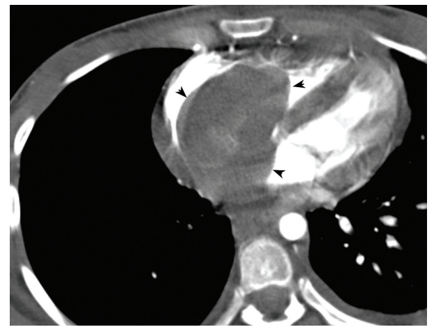
Figure 2: Contrast-enhanced CT scan of chest at the level of the right ventricle shows a large tumour thrombus as a filling defect in the right atrium and ventricle (arrowheads). Hardly any enhancing pulmonary arteries are identified on the right side

A CT scan of her abdomen and chest was performed. A contrast enhanced CT scan (CECT) of the abdomen showed a large enhancing mass in the right adrenal gland. The mass was extending into and within the extrahepatic and intrahepatic course of the inferior vena cava. The liver showed features of Budd-Chiari syndrome in the form of an enlarged liver with areas of patchy parenchymal enhancement and multiple enhancing regenerative nodules. Hepatic veins could not be identified [Fig 1]. A CECT scan of her chest at the level of the heart showed a mass in the right atrium extending into the right ventricle [Fig 2]. The CT scan at the level of the main pulmonary arteries showed a extension of the tumour in the right main pulmonary artery, with diminished perfusion of the lung distally [Fig 3]. The patient died on the third day after admission, before any surgical intervention could be contemplated.