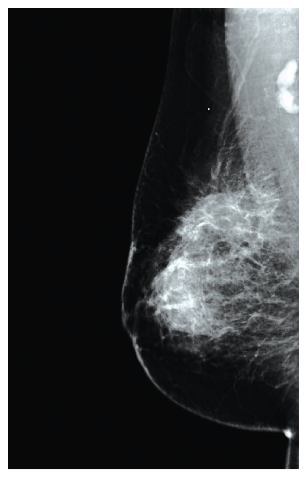
Figure 1: Right breast mammography showing heterogeneity of parenchyma with spiculations extending towards pectoralis muscle, seen under surgical scar site in supero-lateral quadrant

both anterior and lateral views, with a 256 x 256 matrix size, an acquisition time of 600 s per view. First, the anterior planar view was acquired in the supine position; both breasts and the axillae were included in the field of view. The procedure is well described in the European Association for Nuclear Medicine's guidelines for breast scintigraphy. <sup>4</sup>