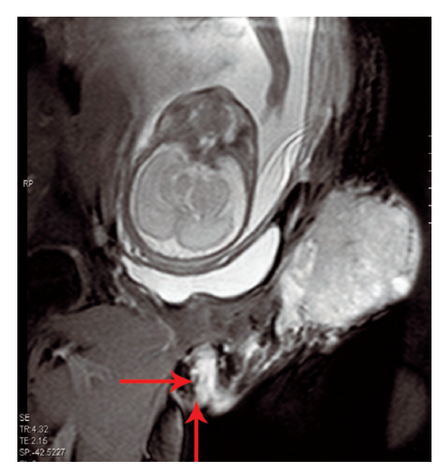
Figure 2: T2W coronal oblique magnetic resonance imaging scan of pelvis shows lobulated mass in left inguinal region with infiltration of skin and sub-cutaneous tissues. Dilated lymphatics seen extending up to vulva (arrows)

The patient did not arrive at our institution until 11 weeks after the initial biopsy, where the examination revealed a left inguinal dark mass measuring 10 x 7cm size and extending from the left anterior superior iliac spine to the pubic symphysis. The mass was mostly solid and lobulated with some cystic component and was very tender [Figure 1]. A complete physical examination revealed a raised nevus 8 x 7mm size with