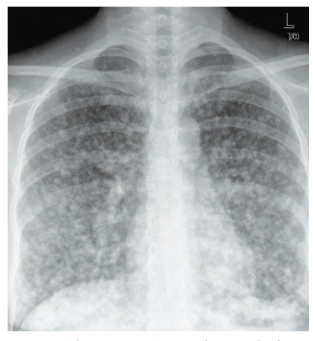
Figure 3: Chest X-Ray PA view: Shows multiple, scattered, nodular, metastatic lesions in both lungs