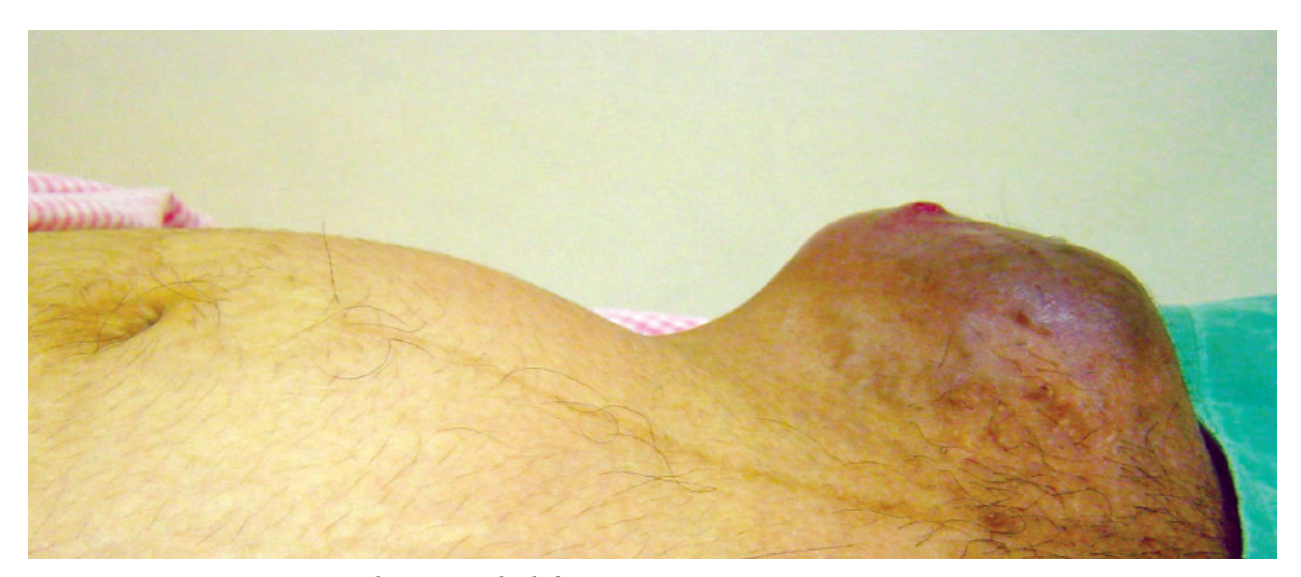
Figure 1: Pregnant uterus with mass in the left groin

and subsequently referred to surgeons with no relief. A needle core biopsy from the node at 16 weeks of gestation revealed a metastatic malignant tumor. Subsequently, the slide review and immuno-histochemistry studies done at a tertiary centre showed positive staining for S-100, melanin-A, vimentin and focal positivity for human melanoma black (HMB)-45 confirming the diagnosis of a metastatic malignant melanoma.