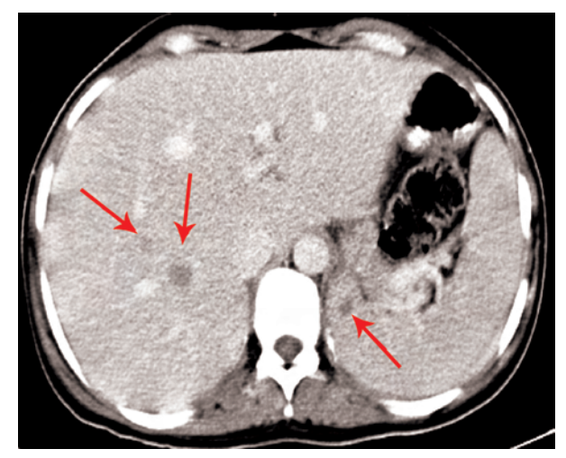
Figure 4: Contrast Enhanced CT Scan shows hypodense, metastatic lesions in right lobe of liver and spleen (arrows)

A metastatic workup soon after delivery revealed extensive involvement of the lungs [Figure 3], liver,