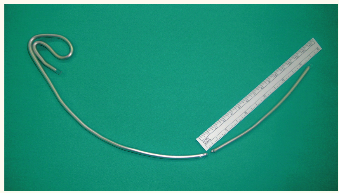
Figure 1: The broken stylet with sheath measuring 13.2 cm.

laryngoscopy was done and something could be visualised above the vocal cord inside the lumen of the endotracheal tube. The surgeon was informed of the incident and requested not to proceed further, till the diagnosis of broken stylet could be confirmed and remediable measures taken.