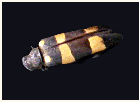
Figure 1: Hycleus maculiventris (1.5 cm in length) insect ingested by the child

coma score (GCS) of 12/15. His heart rate was 140/ min, respiratory rate 30/min, temperature 38°C, and oxygen saturation 92% in room air.