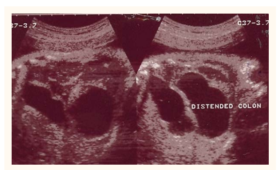
Figure 1: Antenatal scan of fetal abdomen showing two cystic structures.

a dichorionic diamniotic twin pregnancy. Some anomaly was suspected in the second twin during an anatomy scan which would need an evaluation after delivery. A follow-up scan at 29 weeks reported corresponding growth, with the second fetus showing two intra-abdominal cystic structures likely to be related to a duplication cyst and mild polyhydramnios [Figure 1]. The patient had been normotensive and normoglycemic during this pregnancy.