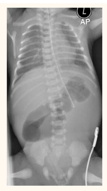
Figure 2: Plain X-ray of the abdomen showing the gas distended stomach and duodenum but no evidence of gas filled bowel loops distal to it.

The patient underwent laparotomy soon after stabilisation. A 5 × 7 cm fluid-filled cyst was noted in the mesentery of the proximal jejunum compressing the small bowel lumen,