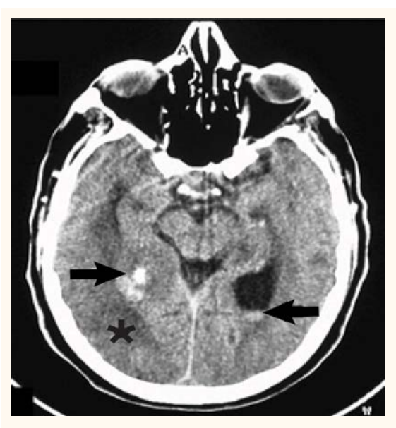
Figure 1: Axial non-enhanced brain computed tomography scan showing the haemorrhagic tumoral mass occupying the right occipital horn (black arrow, left) with surrounding vasogenic oedema (black star). A blood level is seen in the left one (black arrow, right).