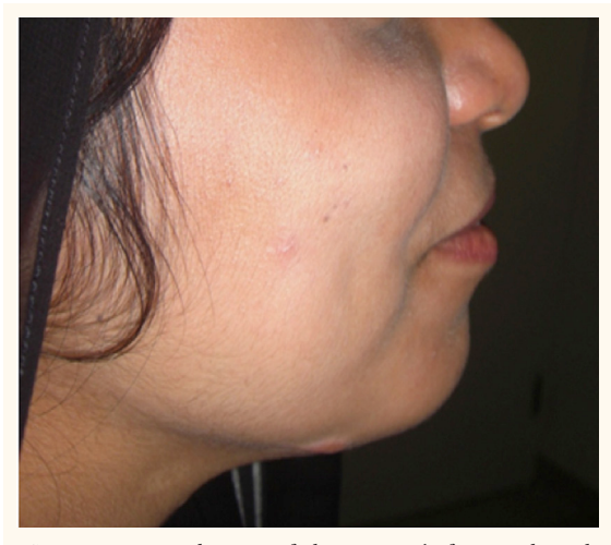
Figure 4: Lateral view of the patient's face and neck three months after iodine-131 therapy. As can be observed, the swelling has completely disappeared.