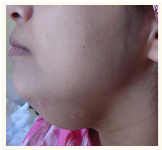
Figure 1: Lateral view of the patient's face showing a large submental ectopic thyroid mass.

mass had developed and was slowly increasing in size. There was no history of difficulty in swallowing or breathing and no history of palpitations, haemoptysis or changes in weight. The past medical history of the patient was insignificant and she was not currently taking any medication. She had two children and her youngest child was three years old.