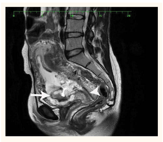
Figure 4: Magnetic resonance image of the pelvis showing a scar pregnancy (white arrow) with an empty endometrial canal and cervix (arrowhead).

The patient was readmitted one week later with heavy vaginal bleeding. A CSP was suspected and then confirmed by MRI [Figure 3]. Her \beta -hCG level was 15 IU/L and she was given one dose of 50 mg/m<sup>2</sup> of methotrexate. After four weeks, during a subsequent outpatient follow-up appointment, it was noted that her \beta -hCG level had returned to negative and the residual pregnancy mass in the anterior uterine wall had resolved.