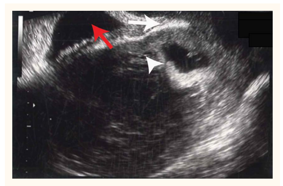
Figure 1: Vaginal ultrasound showing a pregnancy in the Caesarean scar site (white arrow) growing towards the endometrial cavity (arrowhead). The bladder can also be observed (red arrow).

treated successfully with a combination of systemic methotrexate and suction evacuation at the Royal Hospital in Muscat, Oman, between October 2012 and April 2014. All patients consented to the publication of their anonymised data.