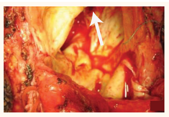
Figure 2: An image showing the fistula to the pulmonary artery (arrow) in a 47-year-old woman with a dissected ascending aortic aneurysm.

At admission, the patient's chest radiography exhibited enlargement of the cardiac silhouette