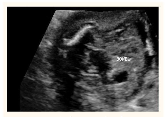
Figure 1: Prenatal ultrasonography of a pregnant woman with multiple sclerosis showing a fetus with a mildly dilated echogenic bowel.

prophylactic therapy as well as levetiracetam at a dose of 750 mg twice daily to control her epilepsy. In 2013, she conceived spontaneously; however, the medication was discontinued only at 13 gestational weeks after her first visit to an obstetrician. Levetiracetam was continued throughout her pregnancy.