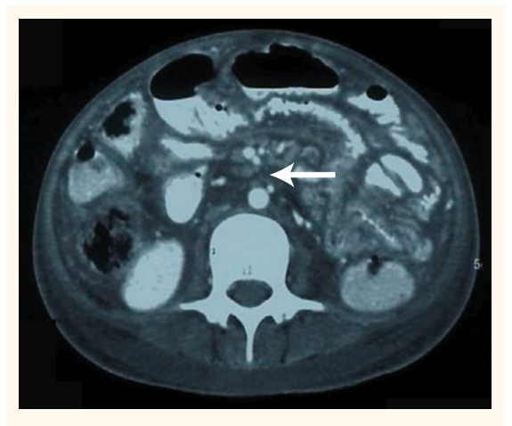
Figure 1: Contrast-enhanced computed tomography scan of the abdomen of a 13-year-old girl with intermittent fever and abdomen pain showing enlarged lymph nodes (arrow) in the pre-aortic region and stranding of the mesentery.

serology test was non-reactive. Her serum protein levels were 5.1 g/dL. While a chest X-ray was normal, an abdominal X-ray revealed multiple air-fluid levels. Ultrasonography of the abdomen revealed free fluid, matting of the bowel loops, pelvic septations and multiple enlarged mesenteric nodes. A computed tomography scan of the abdomen revealed enlarged mesenteric lymph nodes with stranding of the mesentery [Figure 1], indicating a tubercular aetiology. There was no evidence of compression of the inferior vena cava by the lymph nodes. A gastric lavage was positive for acid-fast bacilli. Consequently, a diagnosis of probable abdominal TB was made and the patient was prescribed four-drug antitubercular therapy three days after admission, comprised of rifampicin, isoniazid, pyrazinamide and ethambutol.