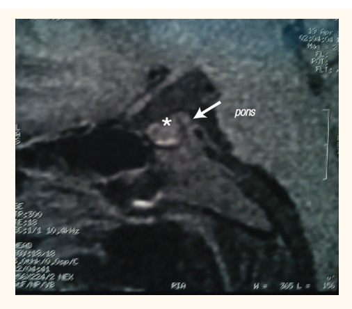
Figure 2: T1-weighted magnetic resonance imaging of a 52-year-old man with a prolonged low-grade fever and hypernatremia showing the absence of a posterior pituitary bright spot (arrow) with spotty infiltration of the pituitary fossa (asterisk), likely due to multiple myeloma.

On the second day following admission, the patient underwent serum protein electrophoresis which revealed a monoclonal band in the γ-globulin region. According to an immunofixation study performed on day six, the monoclonal globulin was an immunoglobulin G κ-light chain. The patient's serum \beta_a -microglobulin level was 1,800 µg/mL. Skeletal X-rays did not reveal any lytic lesions. A T1weighted magnetic resonance imaging (MRI) scan of the pituitary gland region on the seventh day revealed