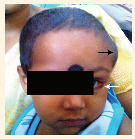
Figure 1: Photograph of a two-and-a-half-year-old male child with a swelling in the left frontoparietal area (black arrow). A small discharging sinus can be seen in the lateral part of the left lower palpebra (white arrow).

Ltd., Tring, Hertfordshire, UK). An ocular examination was normal, except for the small discharging sinus present over the lateral part of the lower left palpebra . A characteristic BCG scar was present on the lateral aspect of the patient's left arm and a single small non-tender left submandibular lymph node was palpable. The rest of the physical examination was essentially normal. A complete blood count revealed mild anaemia with a haemoglobin level of 10.6 g/dL. The total leucocyte count was 11,000/mm³, with 48% neutrophils and 46% lymphocytes. The results of renal function, liver function and serum electrolyte tests were all within normal ranges.