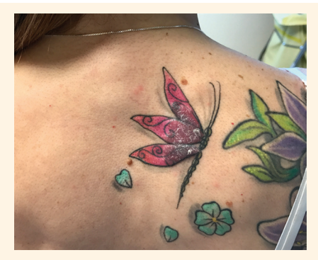
Figure 3: Clinical photograph of the back of a 34-year-old female patient (case two) showing an inflammatory reaction to the red ink in a butterfly tattoo.

A 34-year-old female patient was referred to the Dermatology Outpatient Clinic of the Hospital Universitario San Cecilio, Granada, in 2017. She had an indurated erythematous painful nodule with welldefined borders on a six-month-old back tattoo. The lesion was confined to the areas of red pigmentation [Figure 3]. The patient reported a history of malaise,