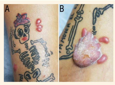
Figure 1: Clinical photographs of the right leg of a 38-yearold female patient (case one) showing an inflammatory reaction to the red ink in a skeleton tattoo.