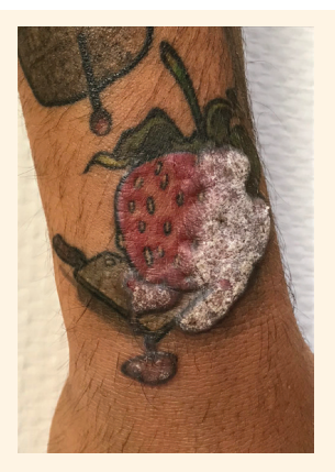
Figure 4: Clinical photograph of the right wrist of a 35-year-old male patient (case three) showing a verrucous reaction to the red ink of a strawberry tattoo.