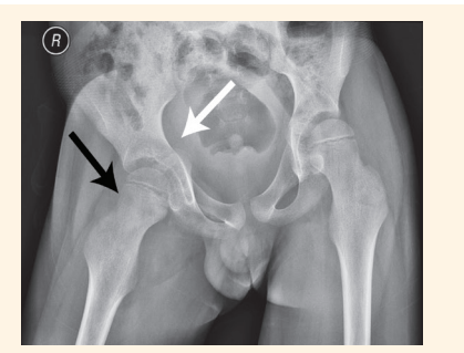
Figure 4 : X-ray of the pelvis of an eight-year-old boy with persistent right hip pain after eight weeks showing periarticular osteopaenia (white arrow) and a possible lytic lesion in the proximal femur of the right hip (black arrow).

ment. Adjuvant chemotherapy was resumed after the surgery; however, the patient relapsed and developed multiple bilateral pulmonary metastases and septic shock. Unfortunately, although he recovered from the shock with intensive treatment, the patient died a few months later as his condition progressively deteriorated.