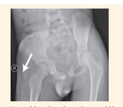
Figure 1: X-ray of the pelvis of an eight-year-old boy with right hip pain at presentation showing pelvic obliquity and an abduction deformity in the right hip (arrow).

apparent leg lengthening and pelvic obliquity. His white blood cell count (WBC), erythrocyte sedimentation rate (ESR) and C-reactive protein (CRP) levels ( 5.43 \times 10^9 /L, 6 mm/hour and 1.04 mg/L, respectively) were within normal ranges ( 4.8-10.8 \times 10^9 /L, 0-20 mm/hour and 0-5 mg/L, respectively). An X-ray confirmed the pelvic obliquity and an abduction deformity in the right hip [Figure 1].