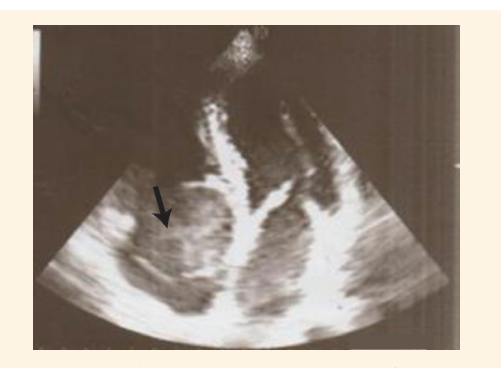
Figure 1: Transthoracic echocardiogram of the heart of a 76-year-old male patient showing a cystic mass in the right atrium (arrow).

no heart murmurs or other abnormal finding such as tachycardia or tachypnoea. Routine laboratory tests and thrombophilia screening were normal.