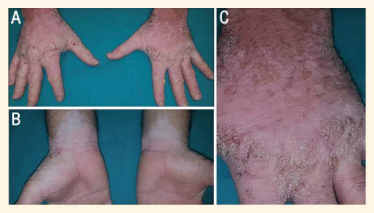
Figure 1: Photographs of the hands of a 45-year-old male patient showing (A) hyperkeratotic and fissured eczema on the back of both hands with skin depigmentation, (B) depigmentation on the ventral side of both wrists and (C) depigmentation of well-defined edges on the back of the hand.

*Ricardo Ruiz-Villaverde and Francisco J. Navarro-Triviño