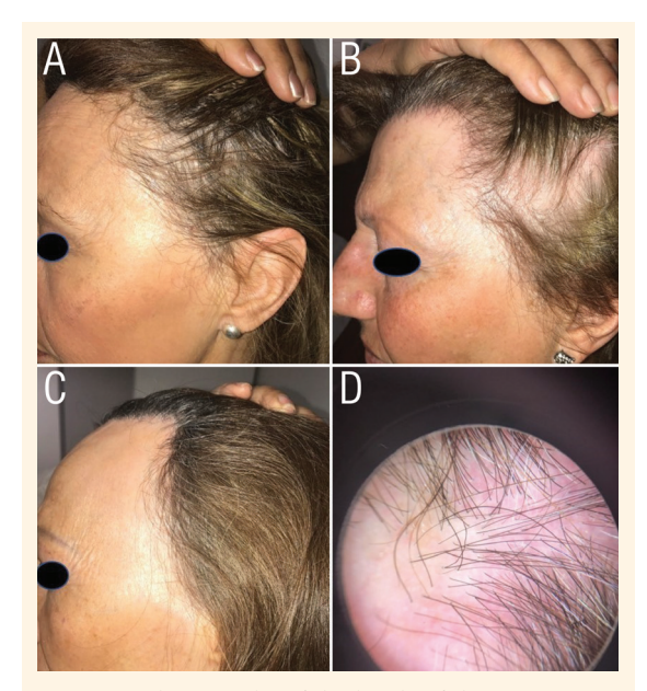
Figure 1: Photographs of the heads of three sisters. A: A 62-year-old woman with frontotemporal hairline recession and partial eyebrow loss. B: A 67-year-old woman with similar pattern and accentuated eyebrow loss. C: A 59-year-old woman with marked hairline recession and almost total loss of eyebrows. D: Trichoscopic examination photograph of the 62-year-old woman showing erythema and follicular hyperkeratosis.

MEDLINE<sup>®</sup> (National Library of Medicine, Bethesda, Maryland, USA) and EMBASE (Elsevier, Amsterdam, Netherlands) databases were searched on 11<sup>th</sup> February 2020 using the term "ALOPECIA AND (FRONTAL OR FIBROSING) AND FAMILIAL". Articles that were published in English, Spanish, French or German as well as articles published for at least one year on the databases were included. FFA epidemiological studies were included but narrative reviews were excluded. Subsequently, two independent reviewers checked the title and abstract of the articles obtained. The full text of the articles was reviewed as well as the bibliography that supported them to search for sources of additional information. Only the articles agreed upon by both reviewers in relation to the inclusion criteria were included in the final analysis. In the case of disagreement, a third reviewer analysed the article. A total of 11 articles were included in this review in which there are a total of 24 cases of familial FFA [Figure 2]. The current case represents the 25th and resulted in a total of 59 individual cases [Table 1].4,7-16