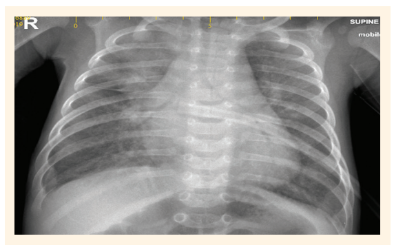
Figure 2: Chest radiography of a two-month-old male infant with cor triatriatum sinistrum showing features of pulmonary venous congestion and right ventricular hypertrophy.

appeared normal with mild mitral valve regurgitation. All pulmonary veins drained to the upper left atrial chamber with no stenosis. There was no right or left outflow tract obstruction. The left atrial appendage opening was seen below the membrane. The aortic arch was normal with no patent ductus arteriosus or coarctation of aorta. Systolic cardiac function was normal. The findings were consistent with CTS and therefore, the patient was referred for surgical repair. Pre-operative transoesophageal echocardiogram (TEE) confirmed the CTS diagnosis and showed a well demarcated CTS with good-sized left atrial appendage below the level of the transverse membranous partition with small fenestration to the lower chamber with severe restrictive flow. Intraoperatively, the membrane was visualised and resected fully and the interatrial communication was closed. He was successfully extubated on the second day and weaned off oxygen support in three days with 100% oxygen saturation. He was discharged home on a small dose of diuretics. On last follow-up five months later, he was asymptomatic, off diuretics, tolerating feeds and gaining weight with no distress. Repeat echocardiogram showed laminar