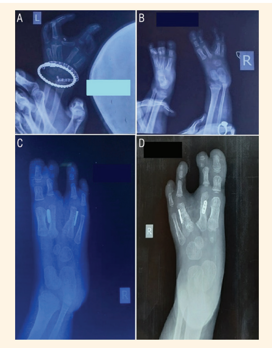
Figure 2: X-ray images of the limbs of a one-year-old female child. A: Anteroposterior view of the left cleft hand. B: Anteroposterior view of both feet showing right cleft foot. C: Immediate post-operative X-ray of the right foot D: Post-operative X-ray of the right foot at 18-month-follow-up.