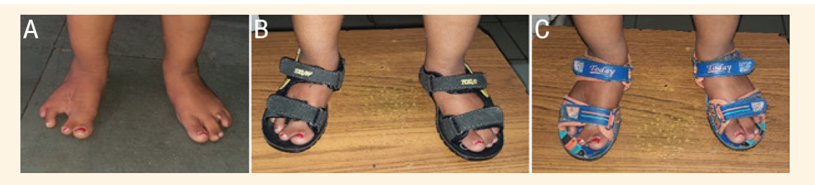
Figure 4: Photographs of the feet at 18 months of follow-up with footwear.

transverse drill holes of 1 mm diameter were used so as to decrease the chances of iatrogenic fracture and suture cut-out in such a young child.