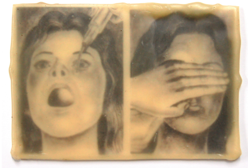
Anatomical Atlas 1 (Alexis Kinloch)

These images are part of an ongoing project to create a contemporary anatomical atlas that looks at the ways that the human vessel is researched, counted and collected. They reflect on the ubiquity of medicine and science in the context of our everyday lives.