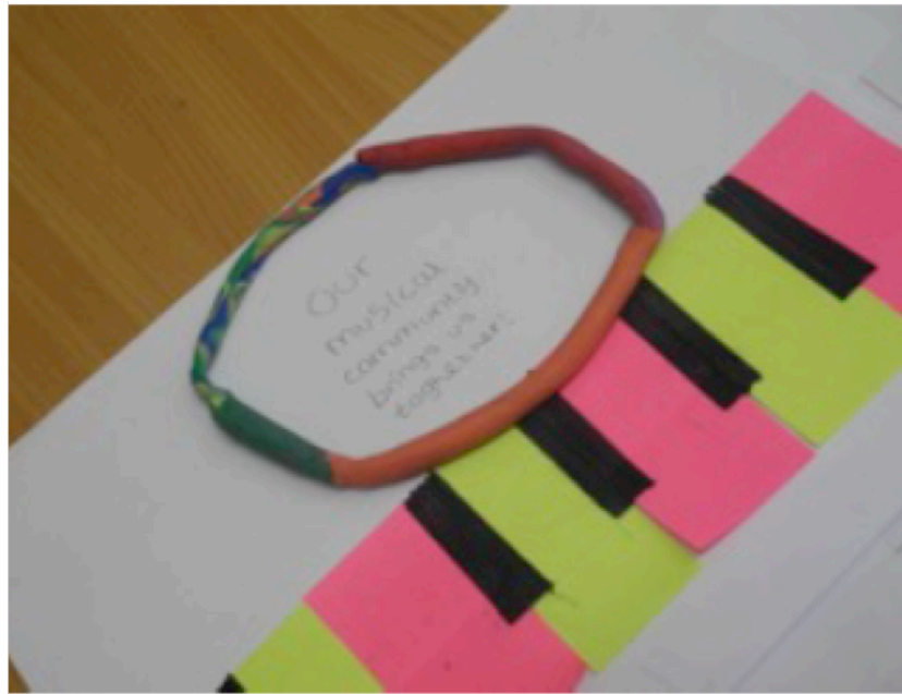
Figure 3. Our musical community brings us together.

practices of belonging. Many of the young people, for example, drew on a strongly musical culture from Eastern Europe. Musician John Ball encouraged them to hear the beat of the drum and in the potential space of listening to each other's beat the students were able to co-create a space of cohesion together. The research team of young people made a collage about their findings, shown in Figure 3. The collage shows the keys of the piano together with a plasticene circle, in which the expression, "our musical community brings us together," is written.