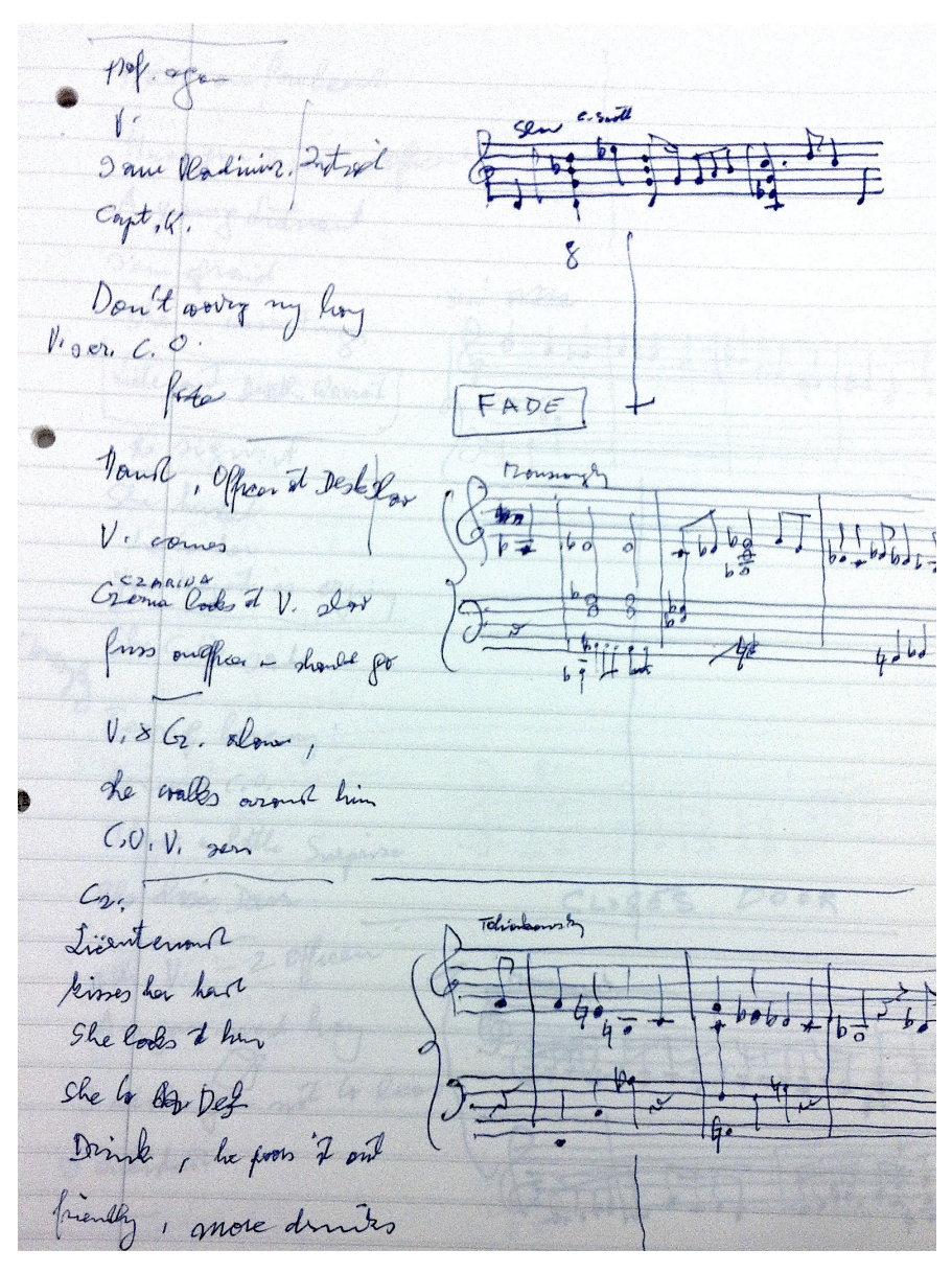
Fig. 2 Spotting session notes for The Eagle (1925) including music incipits (Arthur Kleiner Collection of Silent Movie Music, Films, EA-FI, Box 6, University of Minnesota Libraries)