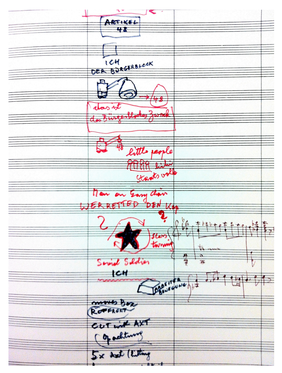
Fig. 1 Sketch for the score to the short film Dem Deutschen Volke, including visual cues