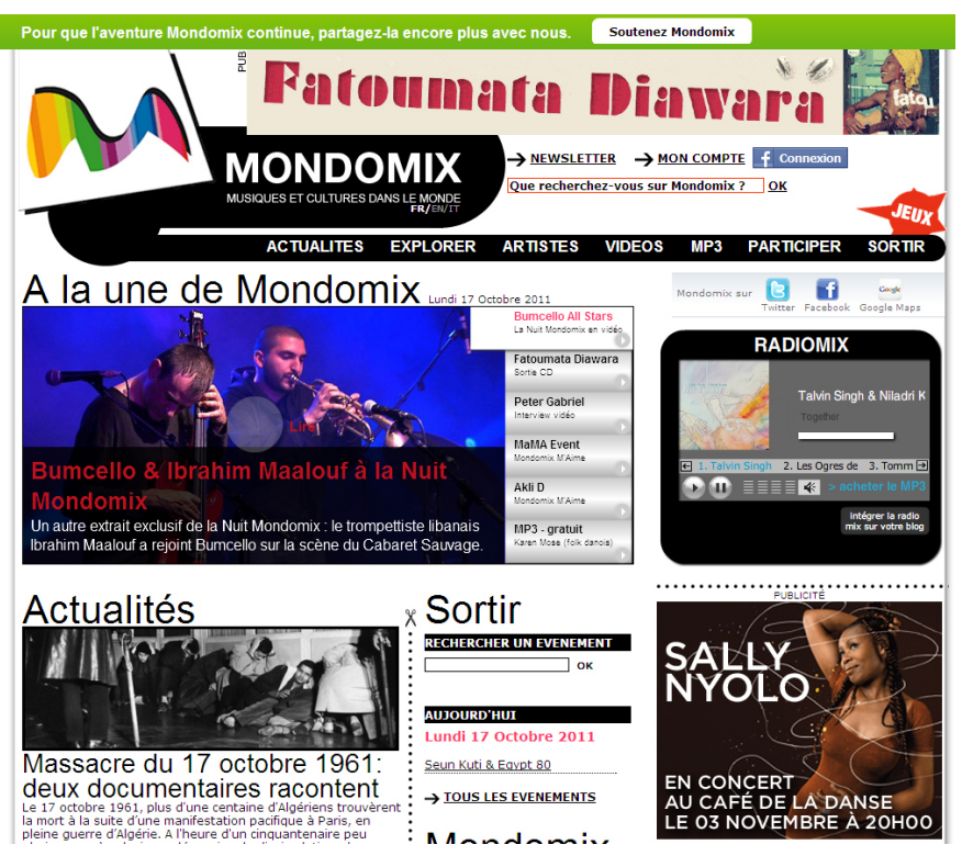
Fig. 2 Homepage of Mondomix.com (October 17, 2011)

ing reliable information, collected at the source by meeting the artists, via press releases or targeted research, which they wrote by carefully working the substance, polishing the form, and injecting their own enthusiasm.