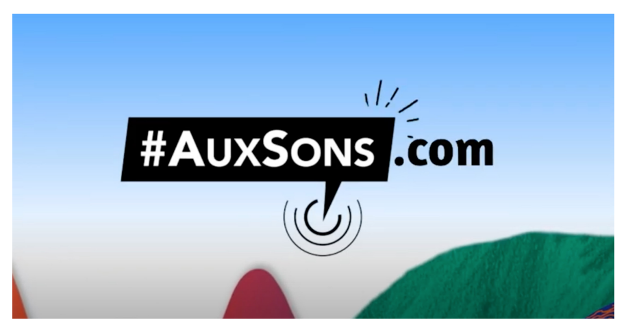
Fig. 3 Still frame from the AuxSons.com presentation video, https://www.youtube.com/watch?v=I-6QirpIOmOw

caring about proffering educational components. Social networks have allowed many artists to address their audiences directly, and their projects to exist and be disseminated without necessarily attracting the attention of the press, who have traditionally served as an intermediary between artists and their audience. However, using this interesting promotional tool requires learning to master its codes.