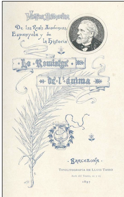
Title page of Victor Balaguer's poetic Lo romiatge de l'ànima (1897), including a modernista or Catalan Art Nouveau portrait of the author by Josep Lluís Pellicer (1842-1901).

Under the weight of rapid urbanisation, the 'society of families' was quickly seen by any attentive outside observer and even more by an immigrant as a closed oligarchy, into which access came only through the regular, traditional channels of linkage. The reliance on kin and, by