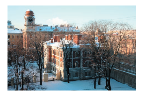
Figure 1. General view of the historic buildings of VNIIM, St. Petersburg, Russia, Moskovsky pr., 19. Photo from the collection of the Metrology Museum hosted by the D.I. Mendeleyev Institute for Metrology, November 2010.

Keywords: D. I. Mendeleev, D.I. Mendeleyev Institute for Metrology (VNIIM), Metrological Museum, monument to D. I. Mendeleev, mural (mosaic) D. I. Mendeleev's periodic system of elements.