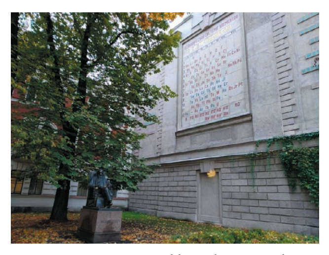
Figure 6. Monument to D.I. Mendeleev and Mosaic mural « D. I. Mendeleev Periodic System of Elements», St Peterbsurg. Photo taken by E.Ginak, 2019.

In 2013–2017, a comprehensive reconstruction and restoration of the military school buildings was conducted. VNIIM sent a request to the State Inspectorate for the Preservation of Monuments to provide for the preservation and restoration of the unique mosaic on the wall. The Metrological Museum provided to the restorers the necessary information from archives on the history of the Periodic System Mural and on its particular features. A number of obvious repairs were carried out: cleaning, washing, reinforcement, etc. There are no plans now to introduce any changes to the 1935 Panel. Order No. 556-r dated 15.12.2017 of the State Inspectorate for Preservation of Monuments lists the "barracks" building and the Table