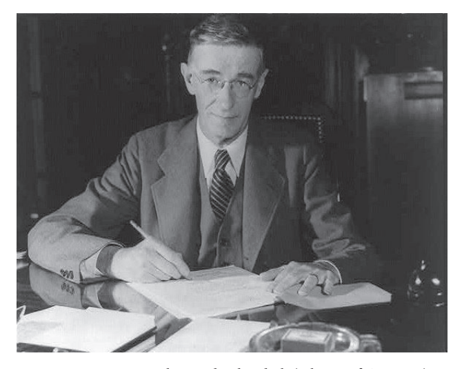
Figure 3. Vannevar Bush seated at his desk.

In 1940, prior to the US joining the War, the British revealed to the US that they had made significant strides