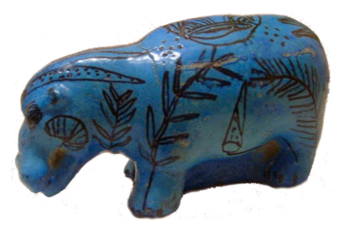
Figure 7. Hippo Goddess (Taweret, goddess of childbirth) in blue faience.

Until the XVIIIth dynasty (1550 – 1295 BC), blue faience was produced from the thermal decomposition of malachite or azurite during the manufacture of the glaze (the color was mainly due to copper Cu in the