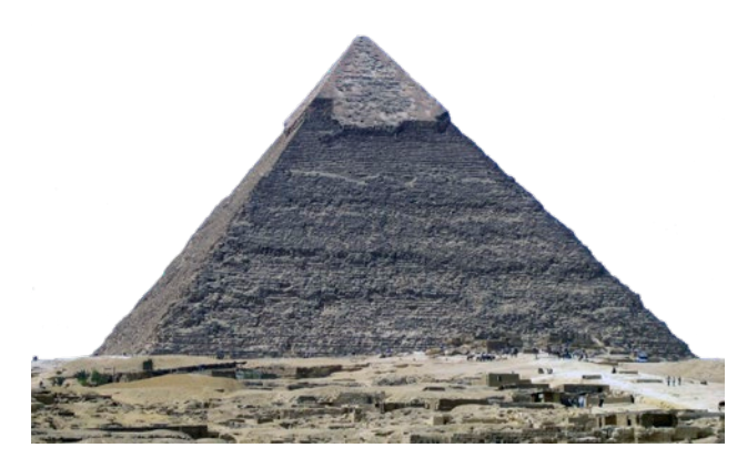
Figure 1. The Kephren Pyramid in which gypsum mortar was used.