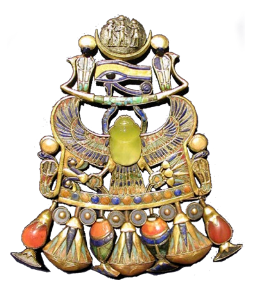
Figure 5. Gold Pectoral (parts soldered by colloidal hard soldering).

... at about 880°C ... the gold in contact with the copper melts to form a welded joint, whereas both gold and copper melt at nearly the same temperature well above this point, viz. 1083°C and 1063°C respectively.<sup>11</sup>