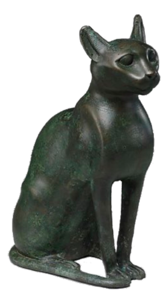
Figure 4. Bronze statue of the Goddess Bastet.

error with the results embodied in empirical observations which were methodically recorded and strictly followed.