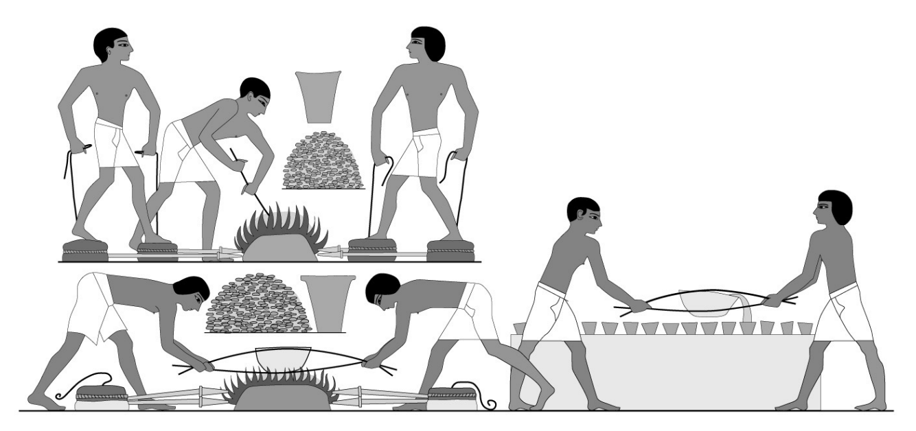
Figure 6. Preparation of Bronze (heating by means of foot bellows).

The secret of its manufacture was lost in the fourth century AD, and rediscovered only in the nineteenth.