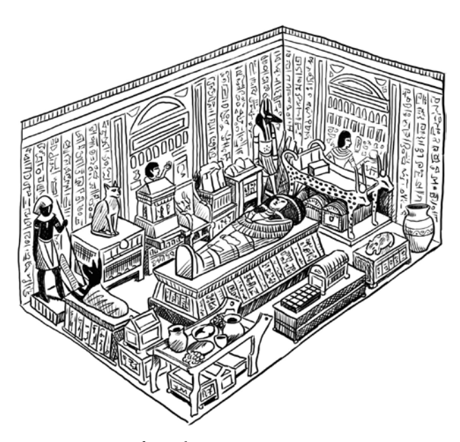
Figure 2. Interior of a tomb.

aration of CaO, requiring a heating temperature close to 900 °C, was not an ideal choice. According to Lucas the scarcity of fuel in Ancient Egypt and the low temperature processing of gypsum undoubtably must have been the reason why Ancient Egyptians preferred gypsum over lime.