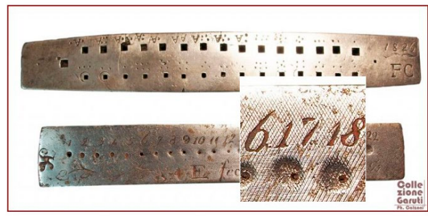
Altri due esempi di trafile più antiche presenti nella Collezione Garuti Realizzate a mano dagli orefici, riportano la data di fabbricazione e le iniziali degli artigiani 1826 e 1839 Provenienza: donazione di R. Venturi e O. Cavalieri

A dedicated tool gives the visitor the opportunity to look closely into every object with a special lens. It allows the observation of specific details on the surface