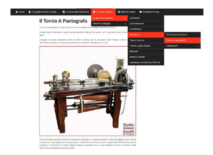
Figure 5. The multi-level menu and one of its pages, dedicated to relevant objects.

all the objects referring to the page. The user can watch them one by one, with a slide show. At the end of each section visitors can go on with the guided tour or jump to another section at their will.