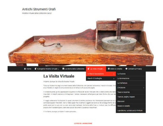
Figure 4. The multi-level menu of the "Virtual Tour".