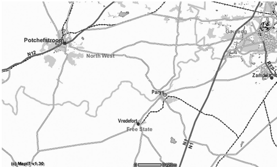
Figure 1 Map of Parys in the Northern Free State, Potchefstroom North West Province and the south-western parts of Gauteng. 6

In an effort to proactively address the apparent inability to defuse the problem of Parys' water, the council of Fezile Dabi District Municipality, of which Ngwathe Local Municipality forms part, opted for an independent assessment of the state of affairs. Members of North-West University's Research Niche Area for the Cultural Dynamics of Water were then appointed to conduct the relevant research. Working in a transdisciplinary research framework and in collaboration with representatives of all stakeholders in the community, the team came to the conclusion that there were indeed problems. While the town's potable water supply appeared to be in a satisfactory condition, raw sewage from the local wastewater treatment works flowed freely into the Vaal River. 7 This had a marked effect on the environmental health of the river which meanders through the Vredefort Dome, a listed UNESCO World Heritage site.