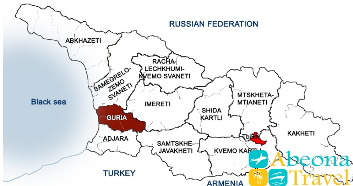
Figure 1. Georgia, Guria region

community and customs, traditions and cultural values with tourism. Sustainable use and proper management of natural and potential tourism resources in the community/village.