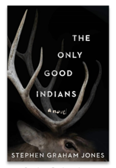
Stephen Graham Jones. The Only Good Indians. Saga Press, 2020.

rationalization coupled with the inability to achieve such measures, and various points of view in this novel. The result is a depiction of resiliency and possibility for an alternative future in which Indigenous worldviews replace the damaging cycles created and perpetuated by Western ideologies. The Only Good Indians is an exceptional contribution to the field of Indigenous futurisms, and it substantiates that both horror and futuristic fiction can serve as an effective medium of decolonization.