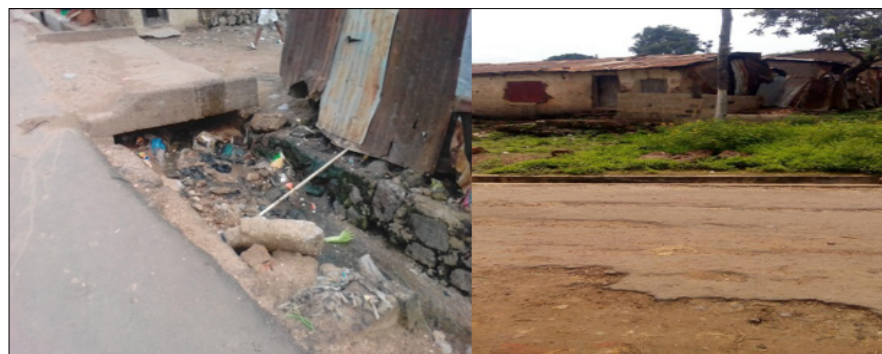
Figure 4: A bare ground covered with roofing sheets used as a bathroom with waste water channelled into the open drains in Kabawa community