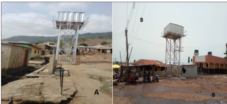
Figure 7A/B: Water supply facilities provided under the Sustainable Development Goals (2016); Figure 7A by the Federal Government of Nigeria (2017); Figure 7B by the community

Popoola and Magidimisha (2020) recognise the role of community in ensuring improved liveability and enhancing livelihood options. Concerning the respondents' preference and willingness to support liveability-enhancement projects, captured open response reveals that the majority of them opted for the electricity project as their major priority for the area. Others include willing to support social housing project, construction of roads, sanitation facilities, drainages, markets, and new schools, youth empowerment programmes, sound security infrastructure, and the support agricultural development projects. The findings indicate that the interests of the residents differed. They were all willing to