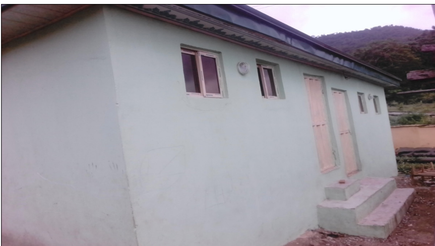
Figure 3: A yet-to-be-commissioned Federal Government-provided 6-water closet toilet facility in Kabawa