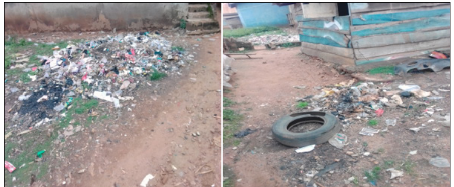
Figure 5: Poor solid waste disposal in Kabawa community

The researchers directly observed that the government water-supply facilities in the area are in a state of disrepair. Residents report the poor perception of potable water provision, although the poor facility provision does not depict the government's 'complete' neglect of the community. Direct observation and interviews revealed government's physical development interventions through motorised solar-powered pipe-borne water-facility provision through the Sustainable Development Goals (SDGs) Project in 2016 (Figure 7A).