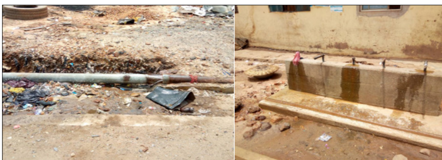
Figure 8: Poor conditions of the water-supply facilities by the Kogi State Water Board