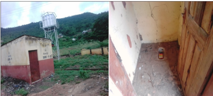
Figure 2: Non-functional 4-pour flush toilet facility in Kabawa community

Interviews were conducted to complement the descriptive variables captured in the study. Three of the interviewees were residents (youth leader, and two community elders) in the sample community, while one interviewee was a public officer