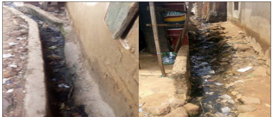
Figure 6: Unsanitary conditions of open drains in Kabawa community