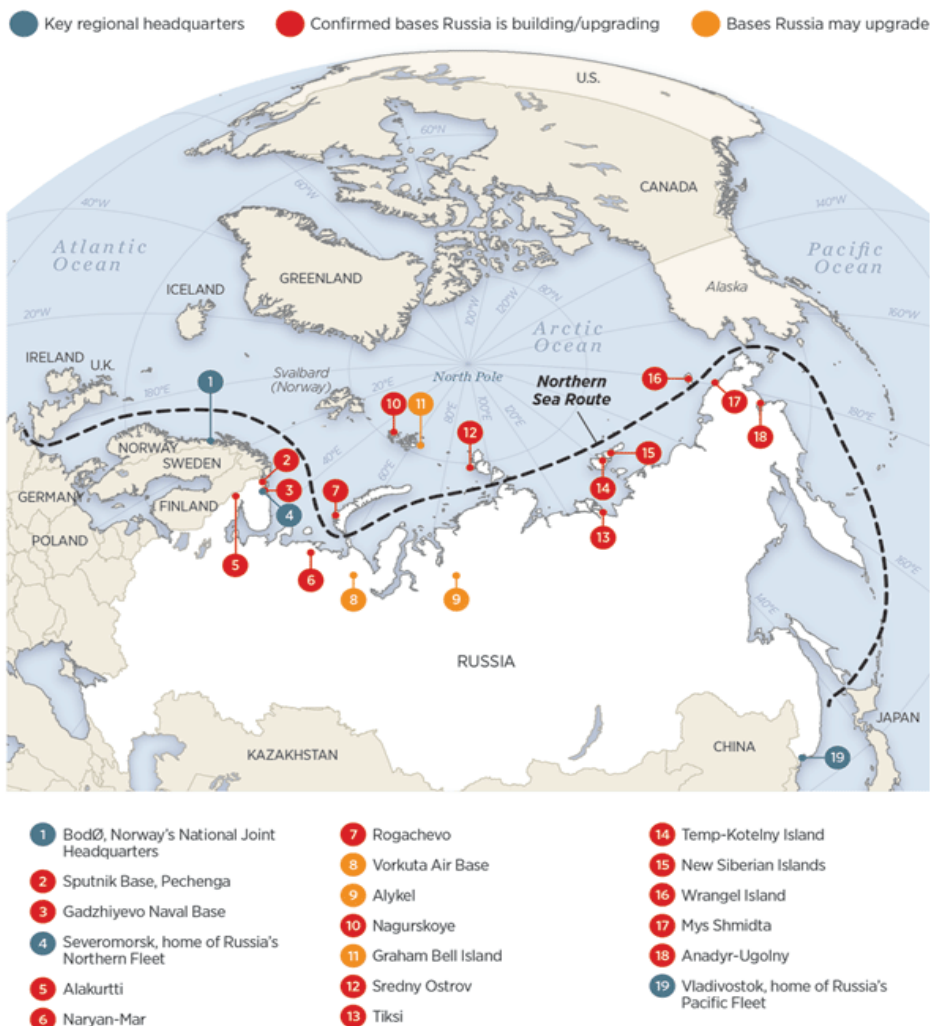
Figure 4. Russia Fortifying Bases in the Arctic Region