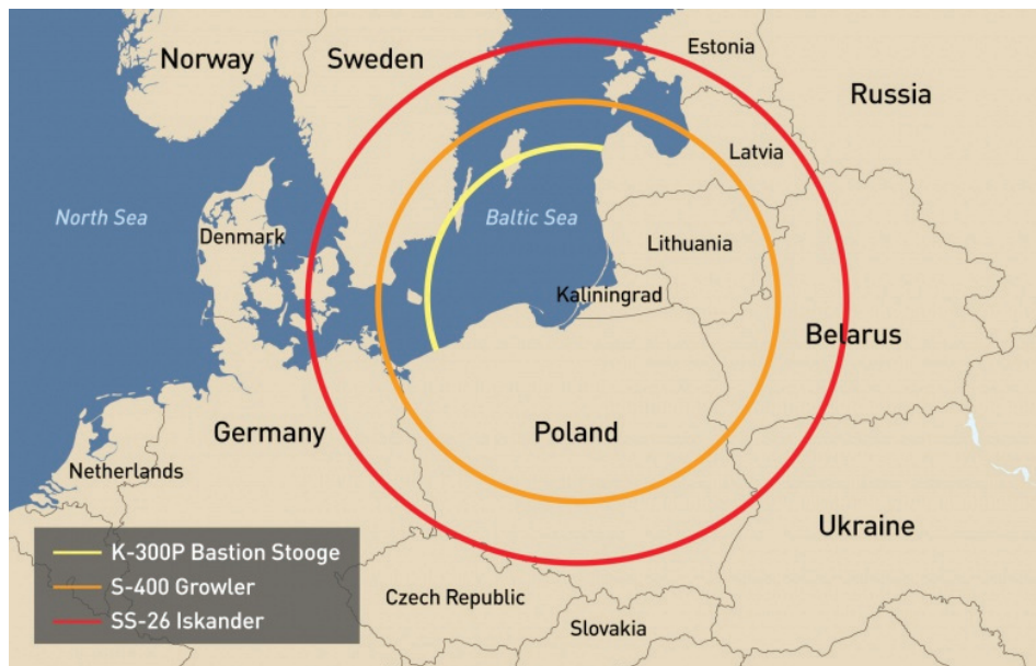
Figure 1. Destruction ranges of selected Russian missile assets deployed in the Kaliningrad region