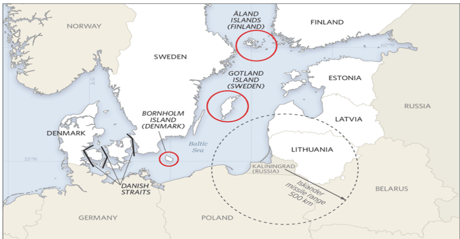
Figure 2. The three islands (marked in circles) that could play a key role in gaining control of the Baltic Sea

NATO and Poland should be concerned not only with the growing Russian A2/AD capabilities in the Kaliningrad Oblast, as the threat posed by the Russian A2/AD has a much wider dimension and also refers to other operational areas. This also applies to Russia's possible deployment of its forces on three islands: Åland, Gotland and Bornholm, which are of strategic importance for the security of the Baltic Sea. Therefore, Russia has been observing these islands for a long time, and the concepts of their occupation are the subject of military exercises and simulations of operational activities.