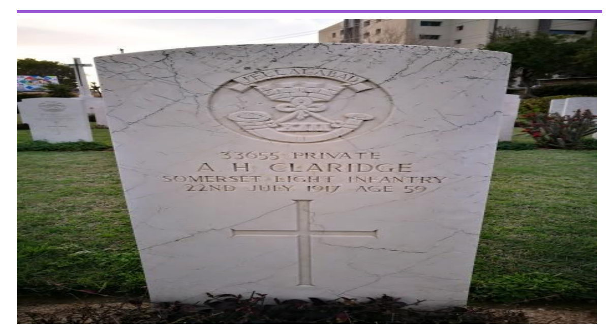
Figure 6 Epitaph of A. H. Claridge