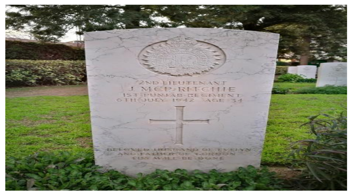
Figure 5 Epitaph of MCP Ritchie

White coloured marble is used to pay homage to the troops who sacrificed their lives to bring peace to the world. Marble is an expensive stone which is best deserved by the martyrs and people who served humanity.