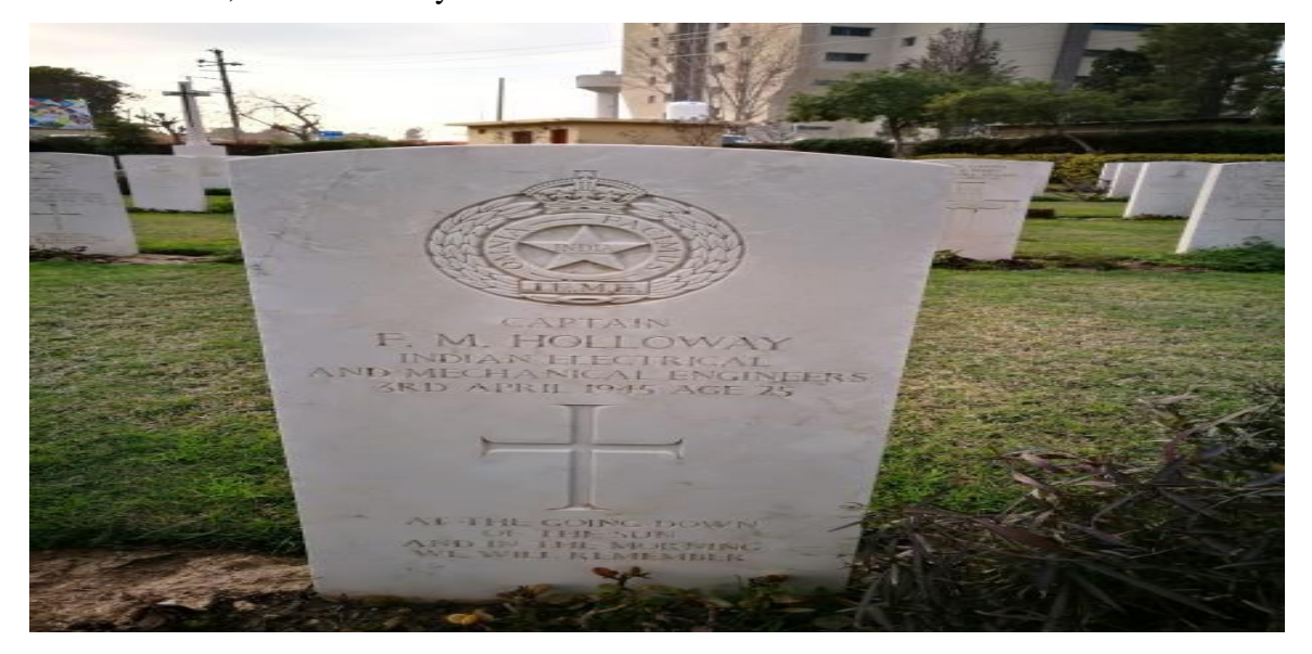
Figure 9 F.M. Holloway