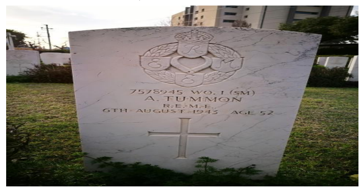
Figure 8 Epitaph of A. Tummon

The theory of archaeology of rank discusses mortuary facilities. The epitaphs under study have white marble gravestones of rectangular shape. They are medium-sized epitaphs, that is, not too big, not too small. Soldiers are buried within the community and the place where the graves of martyrs of both the World Wars are present, generally it is named a section of Gora Cemetery .