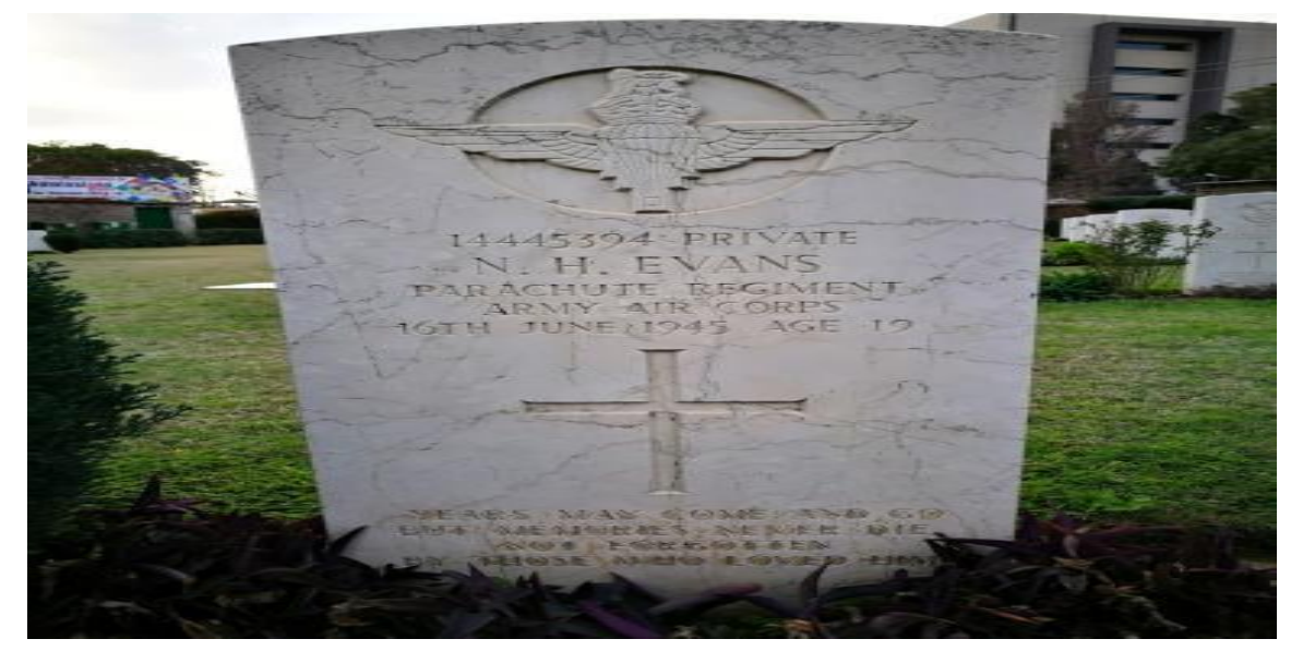
Figure 10 Epitaph of N. H. Evans

paid to soldiers. This gravestone is present among other gravestones in a section of Gora Cemetery Rawalpindi.