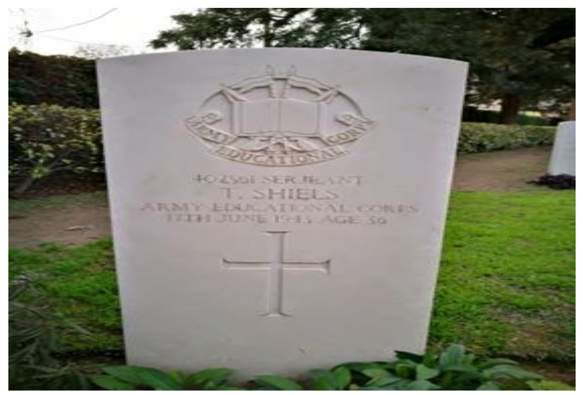
Figure 3 Epitaph of T. Shiels

The stone used for graves is white marble that is used for graves of soldiers on a large scale. Marble of white colour is used to give honour to the soldiers who gave a marvellous performance in world war II. White is the indication of honesty and security.