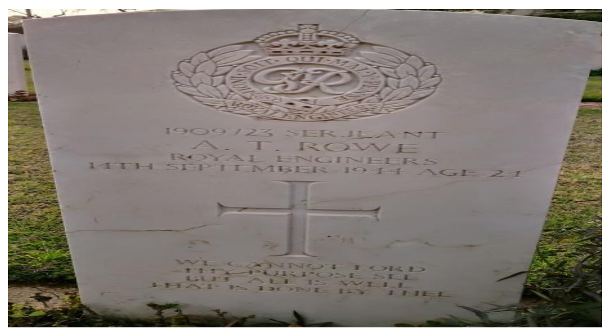
Figure 1 Epitaph of A.T. Rowe

This section presents images of epitaphs and their archaeological as well as semiotic features.