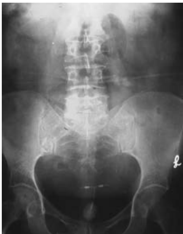
Figure 1. Plain abdominal radiography revealed a large calculus in the bladder and an intrauterine device.