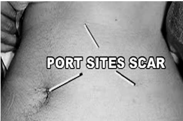
FIG. 4. Unrecognizable port site scars

catheter was applied through 10 mm trocar for two or three days for all the patients. They were followed up with paraclinical tests and physical examination for three months (fig. 3,4). Student's t test was used for comparison of the size of mass and time of the procedure.