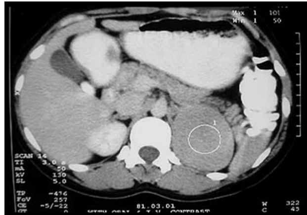
FIG. 1. A 35-year-old woman with dysuria. A 7 cm tumor in left adrenal gland was revealed.

car was applied through umbilical incision and used for telescope. A 10 mm trocar was applied on breast line parallel to umbilicus and a 5 mm trocar was applied on midline between xiphoid and umbilicus. Then peritoneum was opened from the colonic spleen curve to sigmoid on Toltd line and colon was pushed inside. Then Gerota fascia was opened on renal vein, so that adrenal gland and vein were seen. Adrenal vein was cut after clipping bilaterally. Then fat tissue and the rest of the vessels were cut by Mets or electrocautery after clipping bilaterally, so that adrenal gland was totally freed. Three to four (12, 10, 5, and 5 mm) trocars were used in right adrenalectomy (for 5 patients). Similar trocars were applied in left. The second 5 mm trocar was inserted on the breast line at the rib margin to retract the liver if needed. Adrenal gland was seen at the right side behind peritoneum after retracting the liver upward. Hepatocolic and peritoneal ligaments were cut; thus, anterior surface of adrenal gland was revealed. After freeing the gland at inferior, lateral, posterior, and finally medial surfaces and cutting adrenal vein, following bilateral clipping, adrenal gland was removed through an umbilical incision made for 12 mm trocar, after enlarging it (depending on the size of gland) (fig. 2). As a drain, an 18 F Nelaton