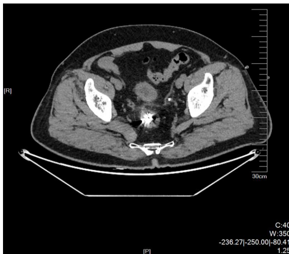
Figure 2. CT scan shows a nodular high-density shadow (titanium clips) in the rectal cavity, without fluid or gas accumulation around the rectum.