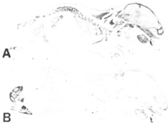
Fig. 1 Whole-body sections of a young rat incubated for alkaline phosphatase showing all the enzyme activity (A) and that of the heat inactivated enzyme (B).

The usefulness of the whole-body sectioning technique is illustrated by some enzyme histochemical studies in which the tissue-specific localization of some isoenzymes is demonstrated. The classic enzyme in studies on mineralized tissues is alkaline phosphatase. In a whole-body section of a young rat alkaline phosphatase activity can be demonstrated in a number of tissues such as bone, teeth, intestinal mucosa, kidney, adrenal cortex, lung and brain. If a section is heated to 56° for 60 min. most of the alkaline phosphatase is inactivated except that in intestinal mucosa, bone and teeth.