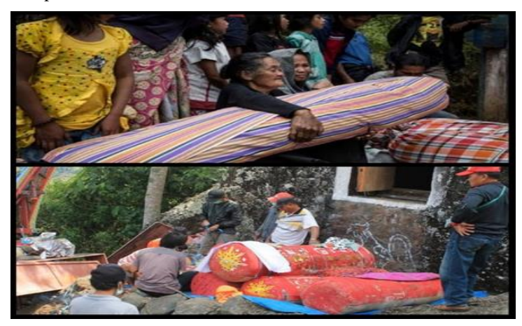
Picture 4.5 The process of entering the bodies one by one, starting with the oldest corpse.

then the messenger closes the door to the burrow as a sign of the end of the ma'pakande nene ritual.