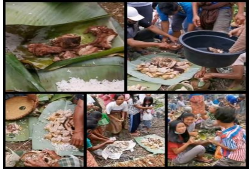
Picture 4.8 Family and community groups take ritual offerings and distribute the to relatives who come as a sign of thanksgiving

The purpose of all actions in the ma'nene' ritual is that these animals can be used for offerings in order to bring sustenance, but humans must not be greedy for excessive slaughter, and follow the rules set out in the Aluk , and are interpreted as an expression of gratitude for farm animals, plants and human life.