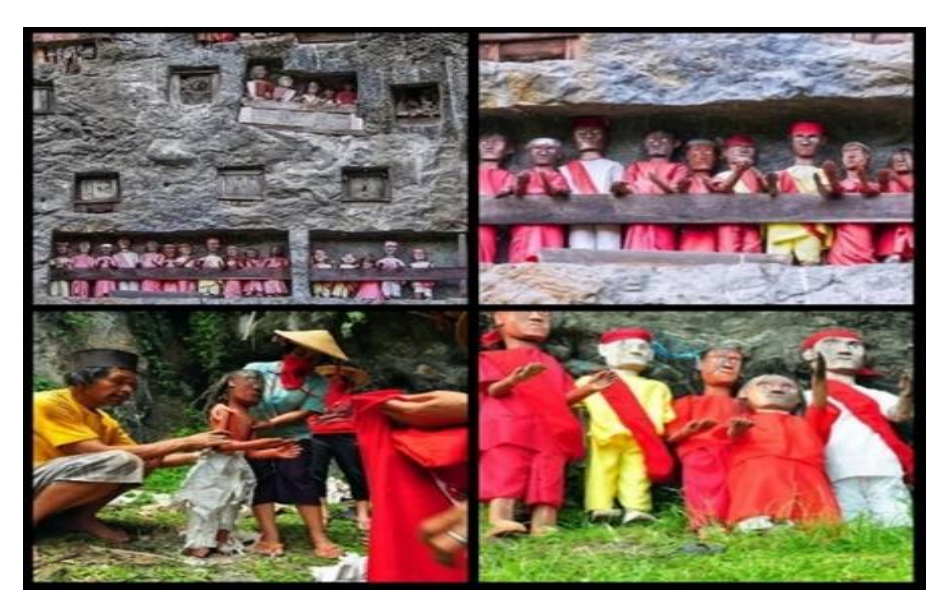
Picture 4.2 Massonda bayu tau-tau 'change the clothes of the statue' that has been weathered and damaged.

Ma'kassa'i is carried out for the next three days according to the agreement of the family rumps, including replacing rotten or damaged crates and if there are rnayat that will be moved to a new liang or patane made by the family. On the last night of ma'kassa'i on the fourth day, before the next day the corpses were put in, they also stayed in the huts so that they could accompany the ancestors, this was also a sign of their love and respect for the ancestors.