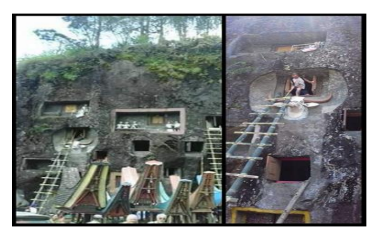
Picture 4.1 The implementation of the Ma'nene' ritual begins with the Ma'bungka' stage of 'opening the door' of the liang 'grave of stones'.