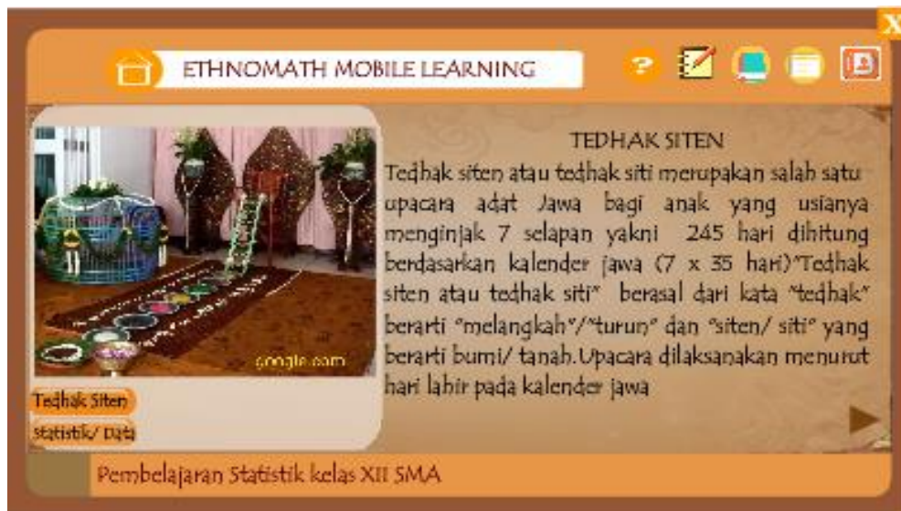
Figure 2. Display of Material

Ceremony. Figure 1 shows the provision of context according to the selected cultural product, Tedhak Siten is used as a context because the ceremony contains a mathematical model that can be used as a starting point for mathematical pursuits; this is in line with research conducted by Rully, which states that learning mathematics must be started. with context as the starting point of learning and providing an understanding that mathematics is close to daily activities (Prahmana et al., 2021).