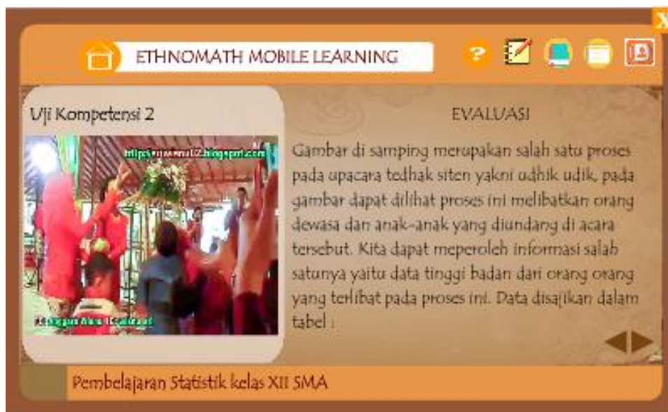
Figure 3. Display of evaluation

Figures 2 and 3 show that the learning design on mobile devices has provided facilities that direct students to carry out learning activities using discovery learning. This method is a way of stimulating students to think mathematically and critically. This statement is in accordance with previous research, which states that learning with the discovery method can develop students' critical thinking skills in solving math problems (Numyani, 2020; Saputra & Sarkadi, 2018; Farib et al., 2019).