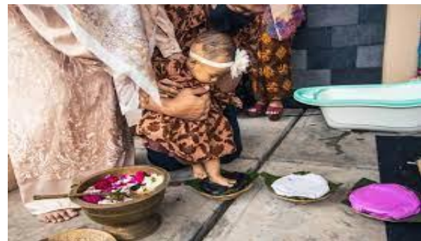
Figure 1. Tedhak Siten

In Indonesia, there are many cultures related to mathematics, one of them is the Tedhak Siten ceremony. Tedhak Siten means descending from the ground in Indonesian. It is a ceremony performed as an expression of gratitude to God when a 7-8-month-old baby begins to set foot on the earth (Yana, 2020). The Tedhak Siten image is presented in Figure 1.