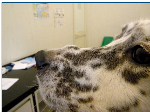
Figure 1. Nostril mass (arrow) that deformed the nasal profile.

The nasal mass was first examined using brushing cytology. This revealed the moderate presence of inflammatory cells, no amastigotes of Leishmania , nor fungal hyphae. The dog was submitted to anaesthesia (Methadone 0.2 mg/kg, Propofol 4-6 mg/kg, Isoflurane) in order to perform a tomographic examination of the nasal structures and surgical biopsy of the lesion. An anti- Leishmania specific serological test (IFAT) was also performed together with popliteal lymph nodes and sternal bone marrow aspiration. A Leishmania culture of bioptic tissue was carried out using a modified Tobie-Evans medium.