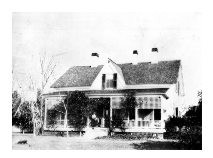
Figure 7. Ned and Genevieve on the porch of the main house. 1913. Black & white photonegative.

The two story frame vernacular, clapboard siding, lifted on piers, and under a gable roof plantation house probably designed by Edward Beadel was built around 1895-96. The house was built facing Lake Iamonia, lifted on brick piers with cinder-block infill. The original two story portion of the house is a rectangle. The plan is a typical four rooms per floor divided by a central hall with a U-shaped staircase on the rear. Henry visited every year until 1919, when he purchased the plantation from his uncle. In 1921 Henry and wife Genevieve added a one story, five bay wing to the east of the existing building. The addition retained the vernacular feel of the original house, and was painted to match. The linking of the two buildings was done with an eighty-six-foot porch supported by square posts with wooden balustrade and a wisteria trellis. Henry also added a three-bay dormer to the original house to increase bedroom space.